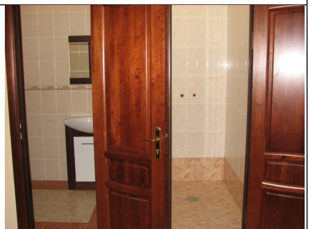
Picture 10 The restroom in the Locker room