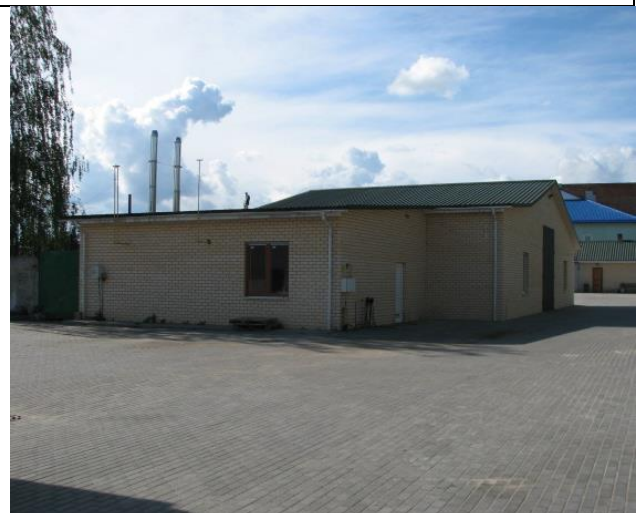
Picture 4 general sight of the Heating boiler station and the Heated warehouse