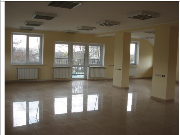
Picture 7 The Room 102 m2 on the 2-nd floor