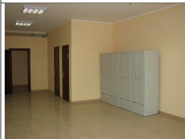
Picture 9 The Locker room