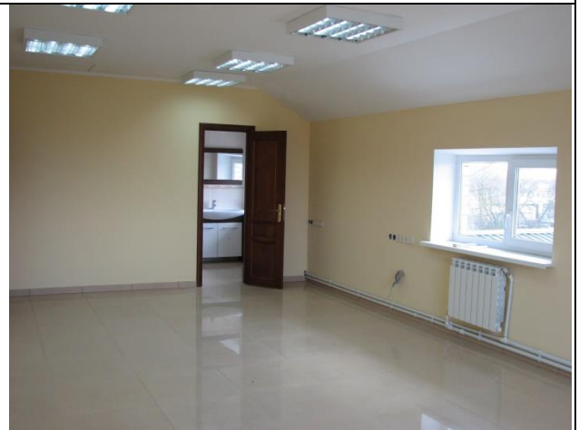
Picture 8 Conference room