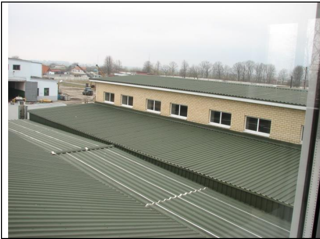
Picture 5 General sight of the roof