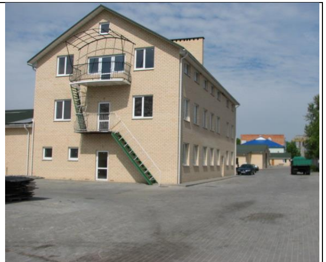
Picture 2 General sight of the the office building