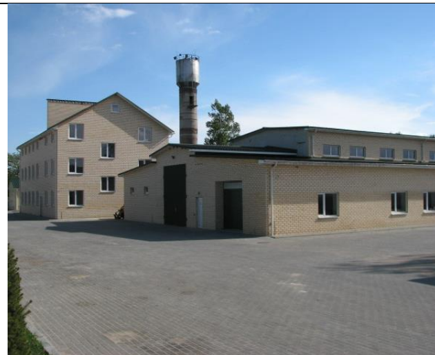
Picture 1 General sight of the Object

In the office space there are 15 telephone landlines and a local computer network.