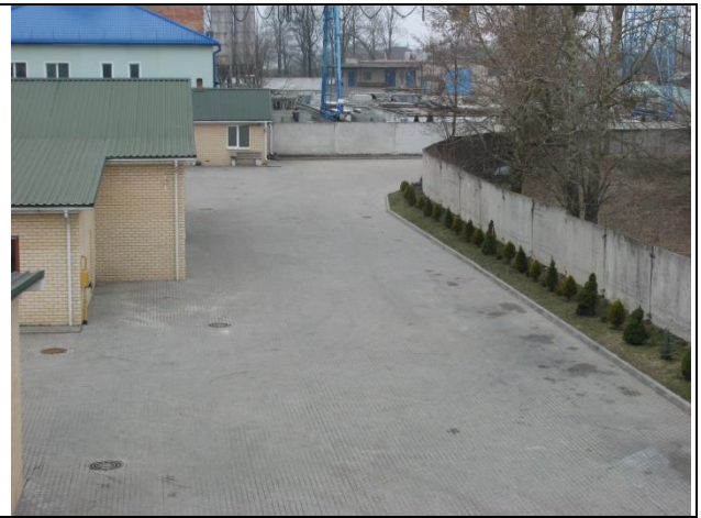
Picture 6 The yard of the manufacturing facility